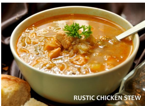
RUSTIC CHICKEN STEW