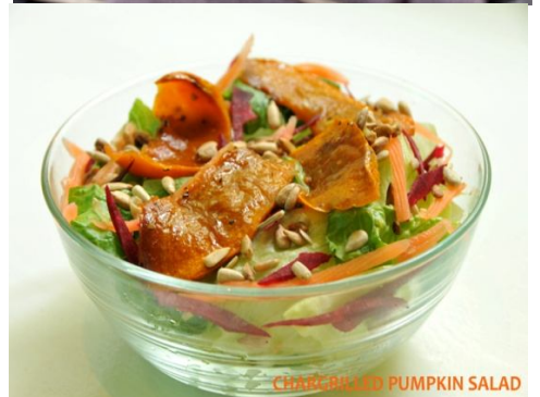
CHAR-GRILLED PUMPKIN SALAD