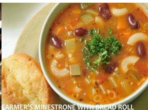
FARMER'S MINESTRONE WITH BREAD ROLL